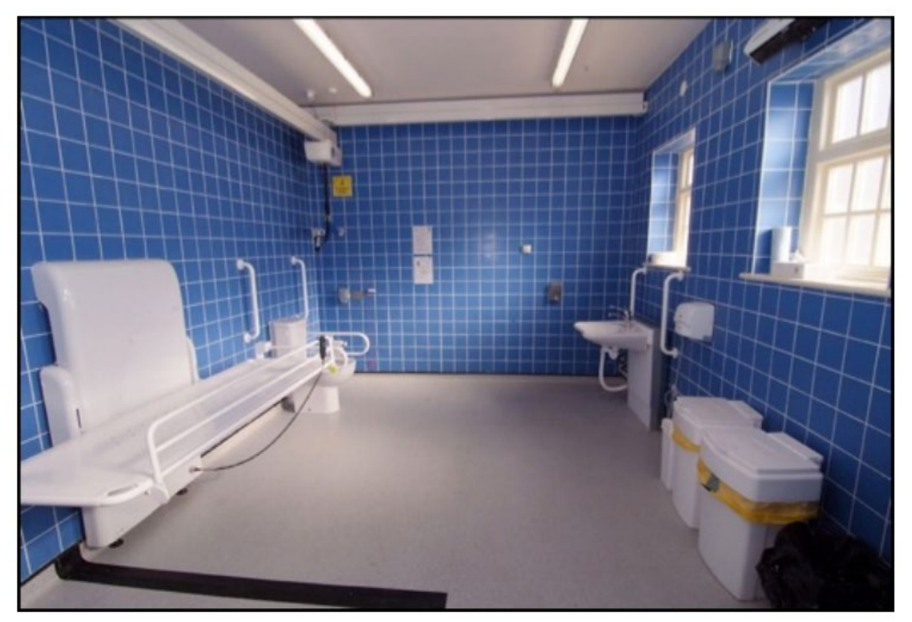
Example of a Changing Places Toilet facility.